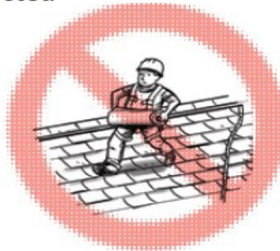
DON'T disconnect from the lifeline