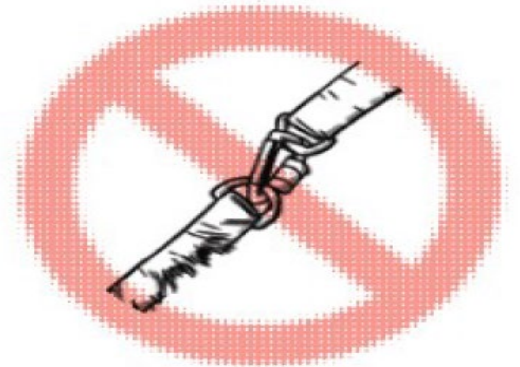
DON'T use defective equipment