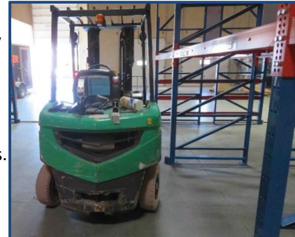
Rear side of forklift that struck and crushed the operator against one of the metal uprights.

In an attempt to free the cord, the co-worker got in the forklift, started the engine and put it in gear. He did not know how to release the parking brake, so the operator reached into the cab and released it. Once the brake released, the forklift started moving forward toward the metal racks. The co-worker swerved to avoid the racks, crushing the operator between the rear of the forklift and one of the metal uprights. The co-worker panicked and jumped from the forklift, which came to a stop when its forks ran into a wall. The operator was transported to a hospital and pronounced dead a short time later. Investigators found that neither worker had completed a required operator training program before operating the forklift. The operator had received on-the-job training and was authorized by the employer to operate the forklift, but the co-worker was neither trained nor authorized.