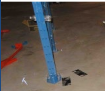
Leveling shims near metal upright where workers were installing racks.

Take required safety training. Your life could depend on it!