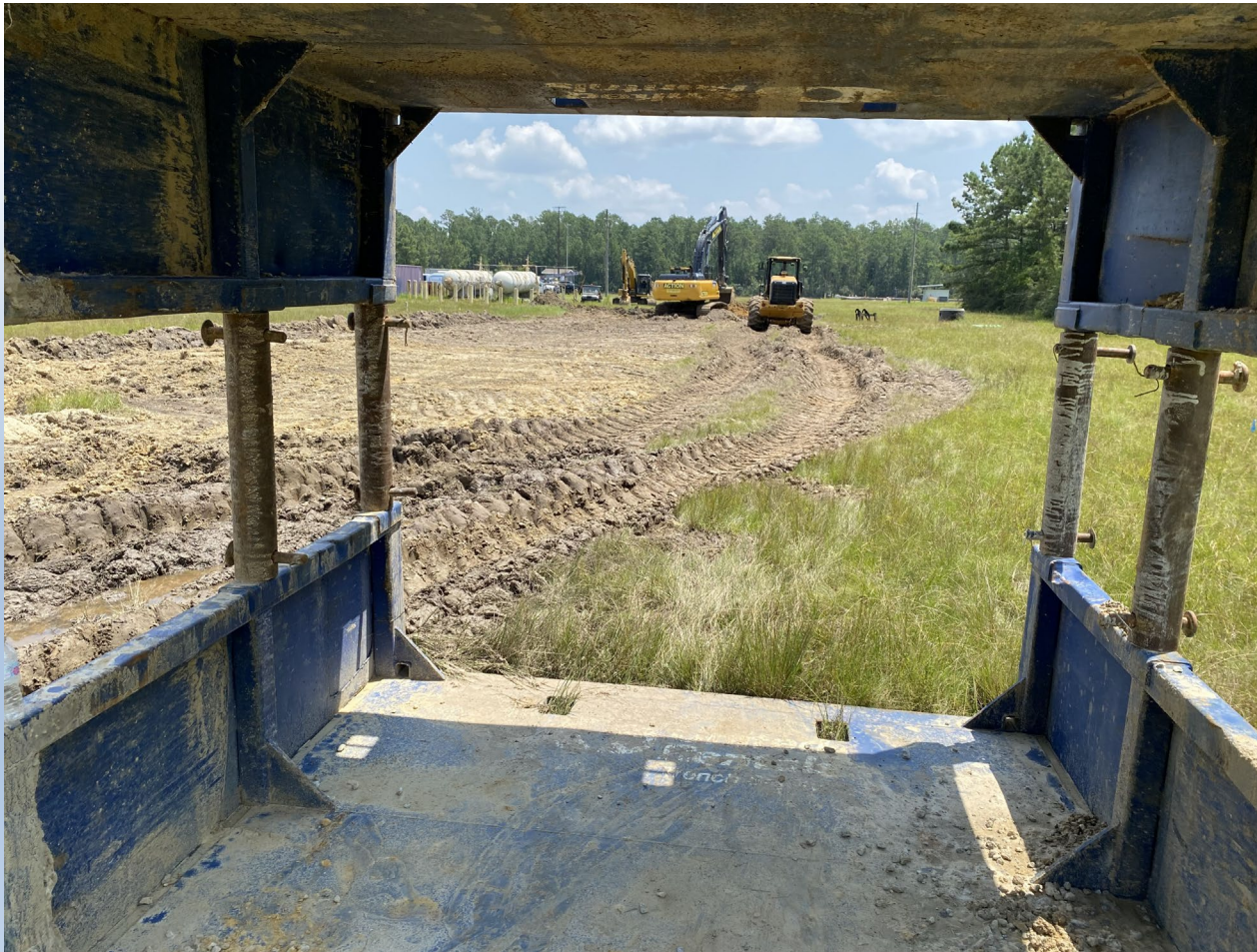
Trench Box with Missing Safety Pins