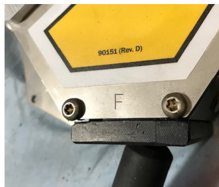
Fig. C - Lower edge of side plate is stamped with "F" - OK for Use