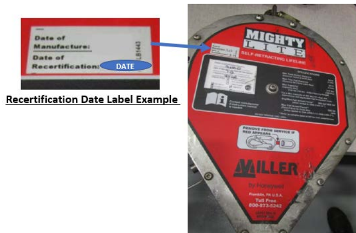
Recertification Date Label Example